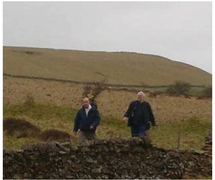
Brethren from Innerleithen making good progress