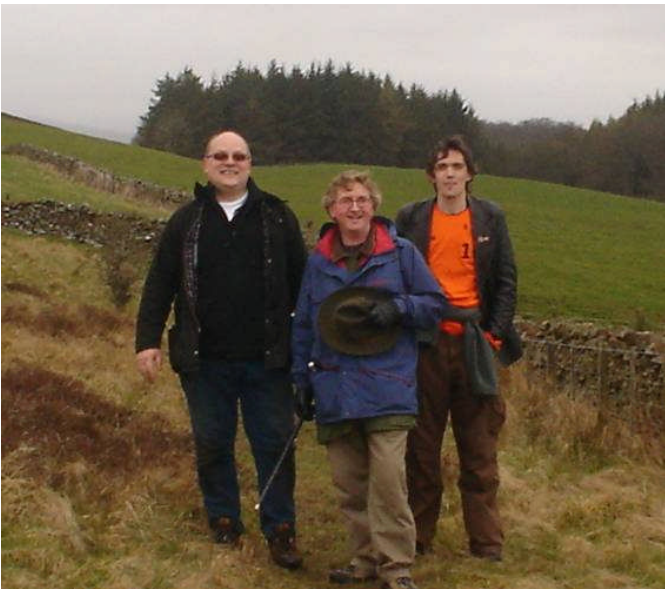
Some of the Melrose Brethren stop for rest.