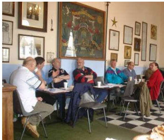
That's it for another year! Back at the Lodge, the Brethren enjoy a well earned refreshment.